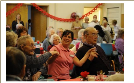
Loving the music